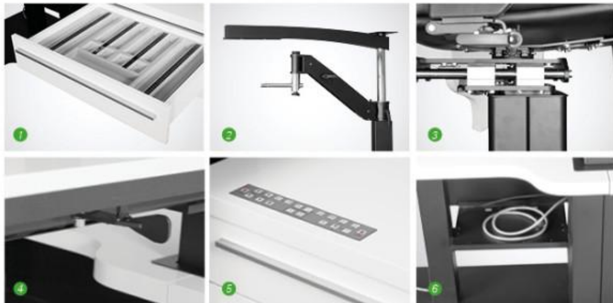
1. Drawer for trial lenses set. 2. Phoropter arm and overhead LED lamp. 3. Motorized chair sliding assembly. 4. Table sliding lock. 5. TOUCH control panel. 6. Shelf for junction box.