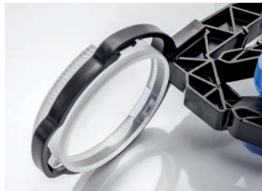
New reduction lens is designed to optimize the view of the retina and the limbus, increasing surgical efficiency