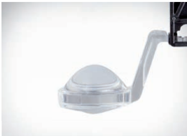
130° wide angle field of view with outstanding resolution