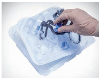
BIOM® ready sterile blister pack