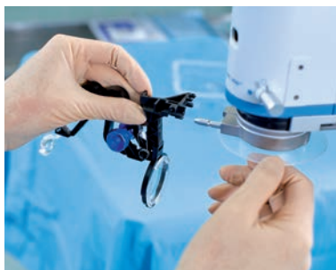
Connects easily to your microscope