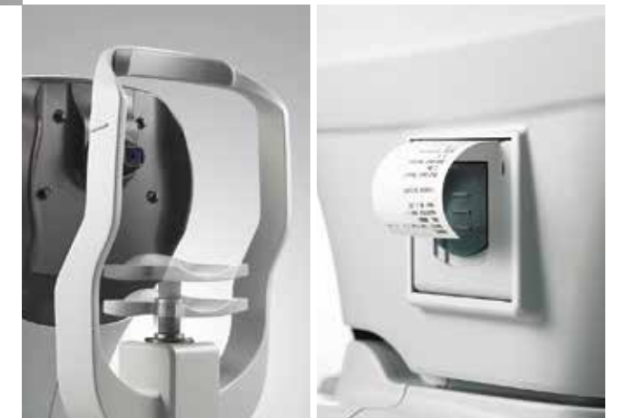
Motorized Chin Rest